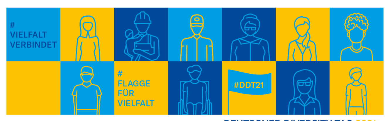
DEUTSCHER DIVERSITY-TAG 2021

In 2021, the Department of Sports and Health Sciences participated in the Diversity Day of the Charter of Diversity, this time with the motto "Show the flag for diversity." With the project "That's us – students introduce themselves!" the Department of Sports and Health Sciences drew attention to the diversity of students by capturing their perspectives on studying. The aim was to show which interests the students represent, to what extent they are committed to them and what motivations they pursue with their studies. Among the twelve Bachelor's and Master's students as well as the PhD students presented were people from Egypt, Australia, China, Kenya, Mexico, Nepal, Russia and Tanzania, who came to TUM mainly because of their interdisciplinarity, multidisciplinary approach to health care and international recognition.