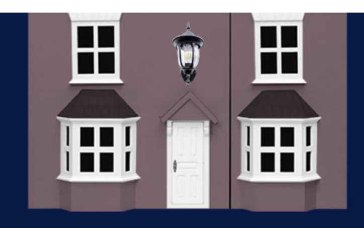
Light fixtures that allow for motion detection or dimming can save energy while reducing the light's footprint on the surrounding environment.

Since transitioning Chelan County's streetlights to LEDs, White and his colleagues haven't yet implemented further