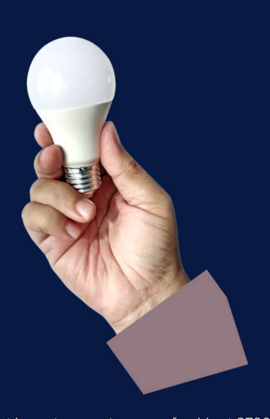
LED lights at lower temperatures, preferably at 2700 Kelvin or lower, emit less blue light and should be used when possible.

expected to comprise 84 percent of lighting installations. Roadways, parking, building exteriors and area lights — which are applications typically high in lumens, a measure of brightness — are expected to see nearly full conversion to LED lights by 2035.