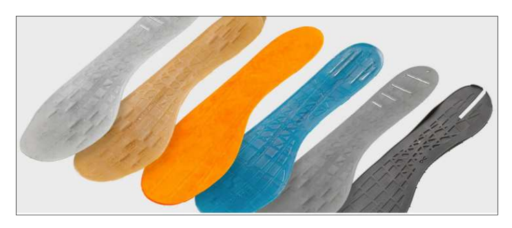
Product presentation On Speedboard (https://shoe-store.at/marke-on/)