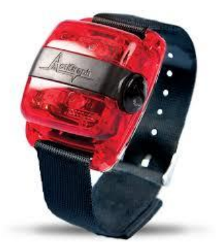
Figure 2: Actigraph for measuring physical activity (accelerometry).